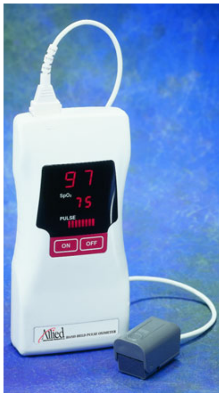
The Allied Pulse Oximeter System includes the Pulse Oximeter, reusable finger probe, carrying case, operations/service manual, and 3 C-cell alkaline batteries.

The Allied Pulse Oximeter is loaded with high quality features that ensure confidence in the reliability of its fast SpO 2 and pulse rate measurements.