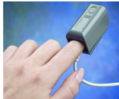
This reusable probe for both pediatric and adult patients is included with the System.

The unit has simple on/off buttons with an auto shut-off feature to save on batteries. A pulse strength bar graph shows the patient's pulse strength. Test information is delivered in bright, easy-to-read LED displays.